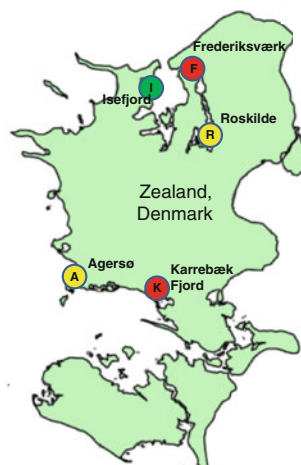
Fig. 1 IBAS with the subsequent “traffic-light” assessment for five eelpout ( Zoarces viviparus ) sampling stations in the Danish part of Belt Sea (Strand et al. in prep.)