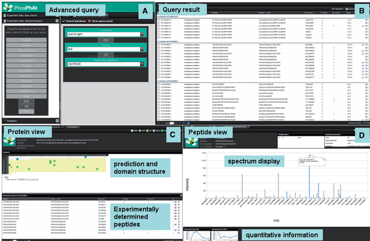
Figure 1. Screenshots of new PhosPhat web interface. (A) Entry screen with advanced search, (B) result window, (C) peptide summary and (D) protein summary.

At the level of the query result summary, the user has the choice of hand-selecting peptides or of selecting all unique peptide sequences present in the query result. The output format is as 13-mers centered on the phosphorylated residue. Only clearly assigned phosphorylation sites (i.e. those annotated as pS, pT and pY) will be included. For multiply phosphorylated peptides, each phosphorylation site will result in export of a separate 13-mer sequence. It is also now possible to export PhosPhat query results in a spreadsheet format. The spectra of individual phosphopeptides can also be exported as an image or in the mgf data format.