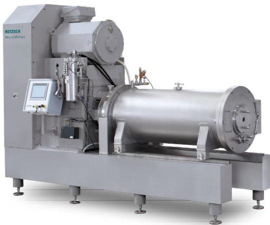
NETZSCH Agitator Bead Mill MASTERREFINER

Wet & Dry Processing Solutions for Your Production