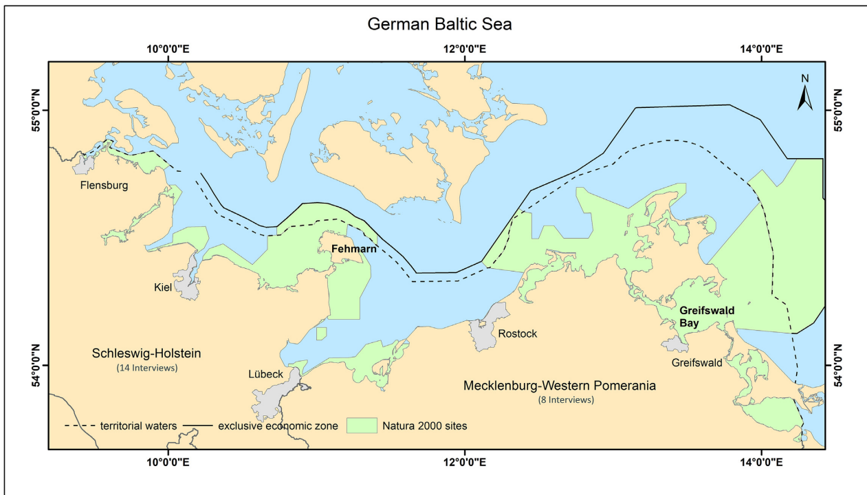
Figure 2. Map of the German Baltic Sea, locating the research sites (Barz et al. , 2020).

of vessels with distinct annual landing sequences (Meyer and Krumme, 2021). Consequently, the groups with the highest fishing efforts were selected based on the hypothesis that high fishing effort would lead to a potentially high probability of encountering unwanted bycatch events (Barz et al. , 2020). A second criterion was whether the landings occurred near Natura 2000 sites (that protect marine mammals and sea-bird habitats). These harbours were identified around the island of Fehmarn (Schleswig-Holstein—SH) and around Greifswald Bay (Mecklenburg-Western Pomerania—MWP) (Figure 2) (Meyer and Krumme, 2021).