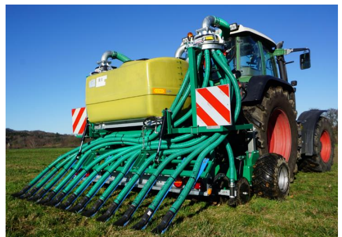
Experimental technique for the application of slurry and digestate to growing crops: trailing hose/shoe or slot technique.