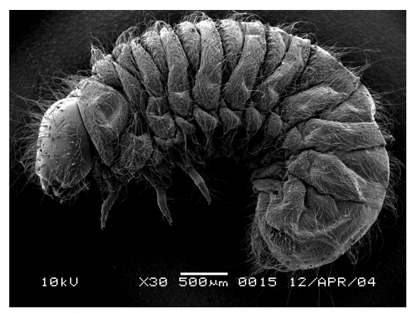
Figure 1 Larva of Tricorynus rudepunctatus.