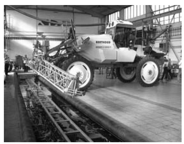
Fig. 2 Determination of the cross distribution by mobile spray scanner at Hustopeče

The first visit was planned for the company AGROTEC a.s at Hustopeče situated about 30 kilometres in the south of Brno. Here an inspection of a self propelled field sprayer was demonstrated (Figure 2).