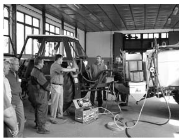
Fig. 3 Measuring of the pump capacity at Rovinka

About 120 kilometres in south direction from here and very close to Bratislava situated is the Slovakian State Agricultural Testing Institute SKTC-106. Among others the task of this institute is the testing and evaluation of plant protection product application technique before its placing on the market and inspection activities. Here in detail it was simulated a complete inspection of a trailed field sprayer including the evaluation of detected defects.