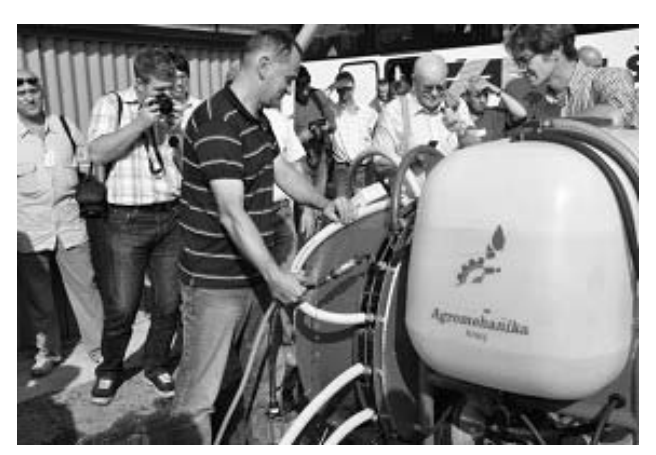
Fig. 4 Determination of the nozzle output of a vineyard sprayer at Hodonin

After that at the Institute Josef Imrich + AKP s.r.o. at Hodonin (Czech Republic) an inspection of an air-assisted sprayer was visited.