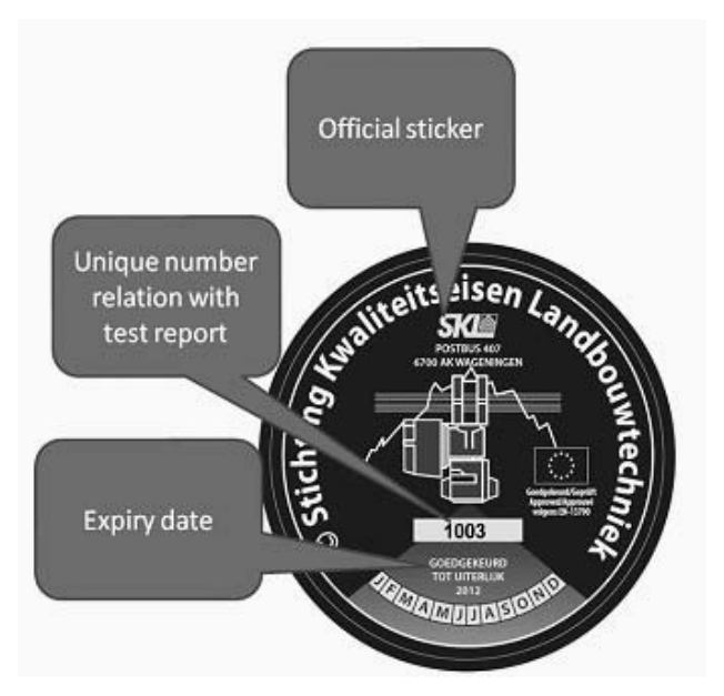
Fig. 2 Example of a label for placing on approved machines

For an easy validation of the validity of the inspection of a sprayer a label should be placed on a clearly visible place on the machine. By design of the label, it shall be clear that it is an official label. When the machine is tested with good results, the test operator will place the label on the machine. To have a relation with the test report, the label shall have a unique identification number. On the label shall also be clear what the expiring date of the certificate is. In figure 2 is an example of a label what is in use in the Netherlands.