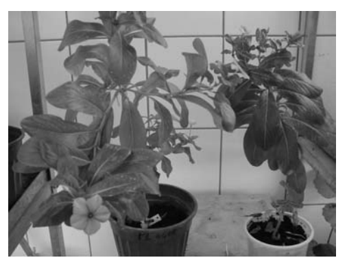
Fig. 2 Symptoms of stunting, shortening of the internodes of the main stem and small flowers of experimentally infected periwinkle (on right) and healthy control (on left).

21st International Conference on Virus and other Graft Transmissible Diseases of Fruit Crops