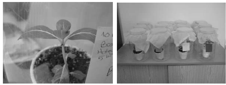
Fig. 1 Test plants covered individually with a plastic-screen cage (on left), Cacopsylla pyri feeding on periwinkle plant (on right).

periwinkle seedlings. Psyllids captured from plot A were first fed on PD infected pear plant for 2 weeks and then transferred to healthy periwinkle plants. All test plants were covered individually with a plastic-screen cage (Fig. 1). Another group of three healthy periwinkle plants was used as negative control. Survival of the insects and symptom expression were monitored and dead psyllids were analyzed immediately for the presence of PD phytoplasma (Garcia-Chapa et al., 2003).