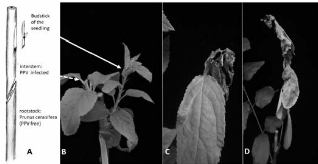
Fig. 1 A + B: double grafting; white arrow: shoot of a seedling in the testing system; dashed arrow: virus infected 'Katinka' after decapitation; C: necrosis on the bark and on the shoot tip of 'Wei 499' ('Ortenauer' × 'Ortenauer'); D: strong hypersensitive reaction of a successful grafting of 'Wei 4926' ('Hoh 4941' × 'Hoh 7172'), dying shoot.

A first rating was done after 6 weeks and a second one after 20 weeks. Further more if one could not detect any visible PPV symptoms the virus was serological analyzed by DAS-ELISA with PPV universal antibodies (Bioreba Switzerland) (EPP0 2004).