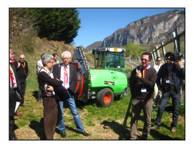
Fig. 3. Visit of the Research Centre Edmund Mach Foundation. Presentation of the results of the drift measurements in orchards and vineyards.