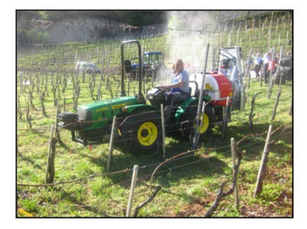
Fig. 5. Visit of the Research Centre for Agriculture and Forestry Laimburg. Demonstration of spray drift reducing techniques in vineyards.