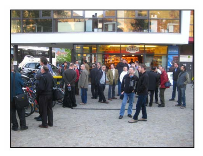
Fig. 1. Departure by bus from meeting point in front of the South Tyrolean Extension Service for Fruitand Winegrowing.