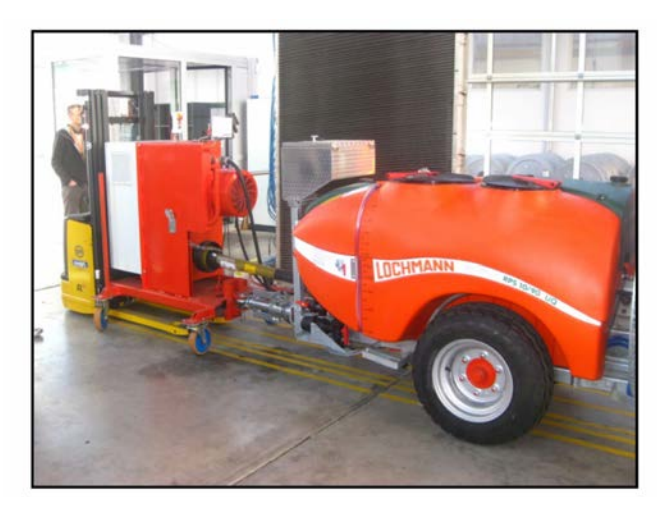
Fig. 2 Visit of the sprayer manufacturer Lochmann. Visit of the sprayer calibration facility and air-flow test stand.