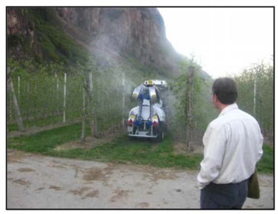
Fig. 6. Visit of the Research Centre for Agriculture and Forestry Laimburg. Presentation of trials on drift-reducing application techniques in apple orchards.