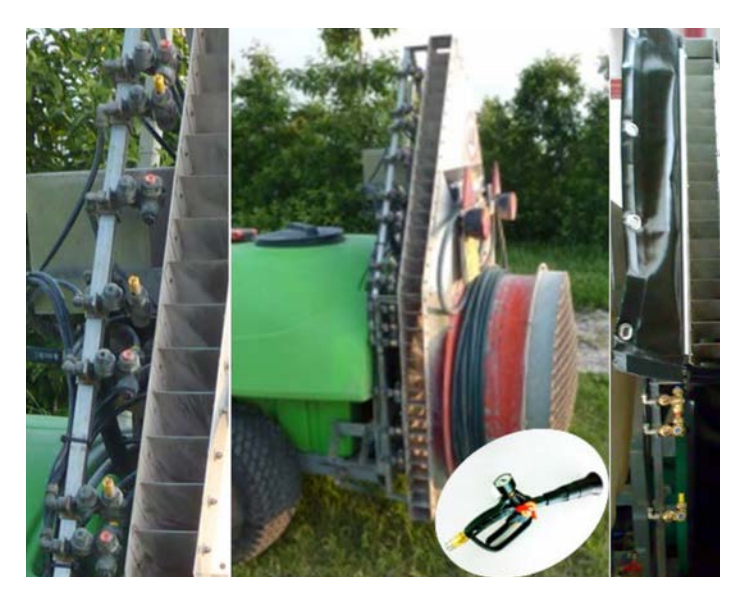
Fig. 15. Equipments compared during the test: particular of the side flow exclusion device (right), the double crown of nozzles (left) activated indipendently and the handheld gun fitted with manometer (oval box).

The experimental activity took place in a Golden Delicious orchard, row distance of 3.4 m, hight of plants from about 2.0 m (fault replacements) up to 3.9 m.