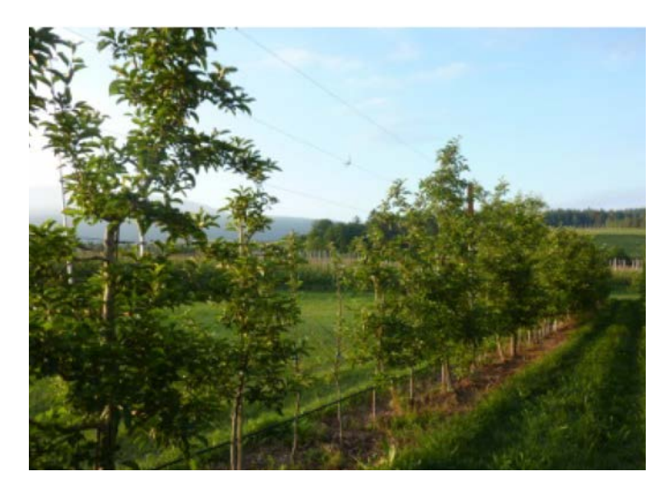
Fig. 2. Picture of vegetation of the experimantal orchard (row of edge).