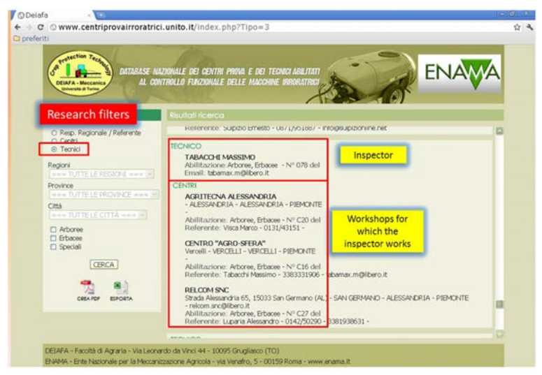
Fig. 8. Example of research results (filter: inspector).