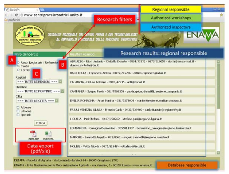
Fig. 6. Database web page of regional responsible.