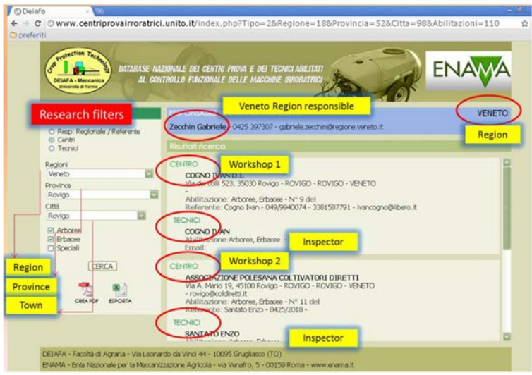
Fig. 7. Example of research results (filter: Workshop in Veneto Region).