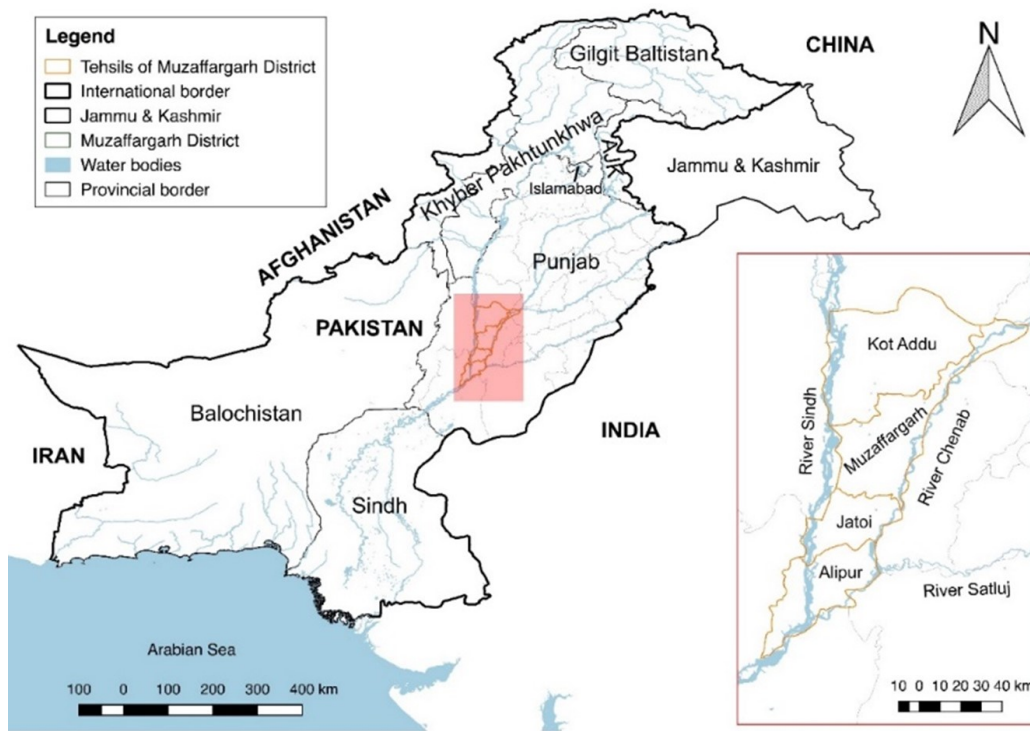
Figure 1: The spatial location of the area of the study.

four administrative sub-divisions (tehsils), i.e., Muzaffargarh, Kot Addu, Alipur, and Jatoi (Figure 1).