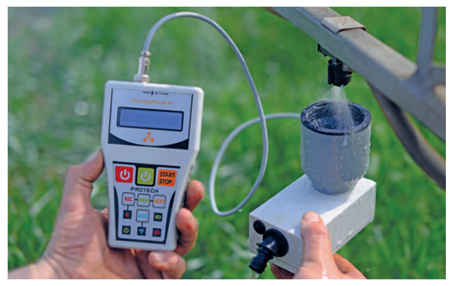
Fig. 1. MicroFLOW in use.

The aim of the research was to find alternative, faster, cheaper and more accurate methods of measuring the flow of liquid from field sprayers nozzles with free flow, and the development of devices for doing so. I believe that the prevalence of use our tools will significantly speed up the inspection process, while increasing its reliability and precision. Developed devices MicroFLOW (Fig. 1) and SprayerTEST (Fig. 2) use well known principle of measuring the intensity of the free flow of liquid from any source actually. They use also best technical solutions presented by other companies, but our invaluable advantage is the possibility of any technical adaptation and modification of software. Microflow and Sprayer Test has been developed after several months of testing, training and research.