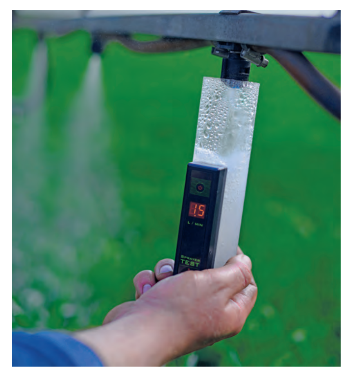
Fig. 2. SprayerTEST in use.

Work on the device is still going on - in the adaptation displays, flow meters, algorithms. The target will be designed several versions of the device, for simultaneous measurement of a few or several nozzles at the same time. Any of your opinion will be my determinant for further design work and programming, which allow for the improvement of technical parameters and performance presented devices, and will stimulate to the completion of the inspection device for orchard spraying. Also 2.4 GHz communication become available.