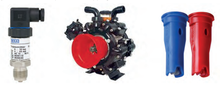
Fig. 1. Example of component which are certified by suppliers (Quality checks are done at supplier facility)

An inspection can be performed on shipments of goods arriving at a manufacturer's location it may include: functionality testing, drawing check (+ measurements), material analysis and surface inspection of shipping containers.