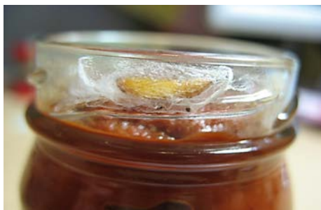
Fig. 7 Pupa of the IMM in a hibernation cocoon found under lid of jam jar

Simply, larvae of the IMM fall down on the surface of jam when a customer removed a lid off the jar, devastating a silk construction of the cocoon that was formed outside of jar, just under its lid.