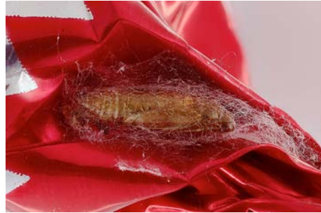
Fig. 3 Remains of pupal skin left by an emerged IMM moth