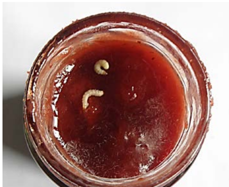
Fig. 8 Two live larvae of the Indian meal moth on the surface of the final product

The cause of consumer complaints are the IMM larvae or pupae in cocoons found within the product. Only one larva or a few larvae in a package with their webbing and frass are very repulsive to homeowners, and very costly to the companies that market the products. Consumer complaints about the presence of insects on or in packaged products can affect the reputation of the brand or manufacturer.