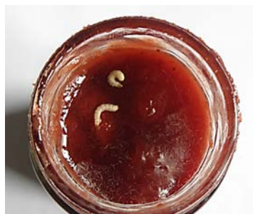
Fig. 8 Two live larvae of the Indian meal moth on the surface of the final product