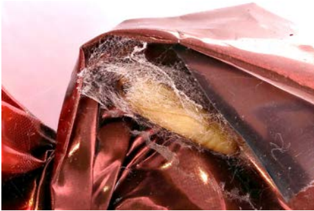
Fig. 2 A live pupa of the IMM within the candy wrappers.