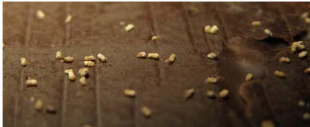
Fig. 1 Excreta (frass) of the IMM larvae on the surface of the chocolate bar with no other signs of the larval activity.

This chocolate bar was traditionally packed, and the aluminium foil and paper were used as packaging materials. Wrapping materials did not constitute a barrier that prevented the larval invasion. Thus, fully grown larvae visited the product for a short time, and they laid down only fecal pellets and a few threads of silk webbing on the surface of chocolate bar. Probably, a nearby product was infested and it formed a source of wandering larvae.