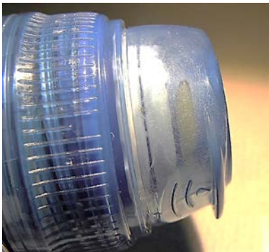
Fig. 4 Larva of the Indian meal moth under the cap of bottle with mineral water.

The larva found under the jar lid build already a delicate cocoon, indicating the summer contamination. This larva seems to be freshly pupating, thus it contaminated ketchup jar 1-2 days ago, and it happened in the customer house, not at a premise of the manufacturer nor in the retail food store.