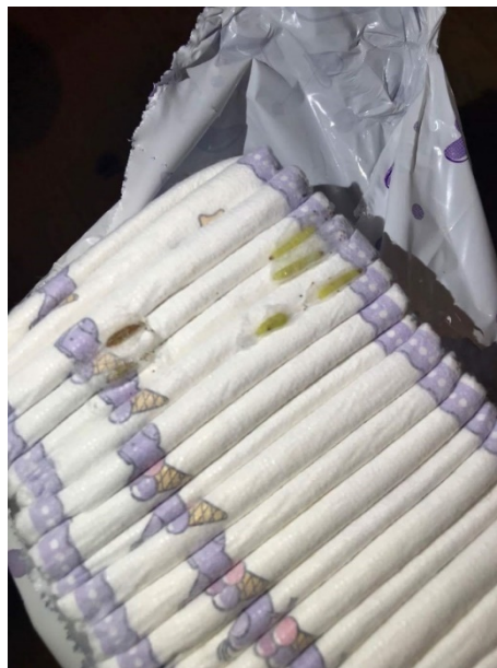
Fig. 9 The wandering larvae of the IMM found a good hiding place for pupation within the diapers (nappies).

When full grown, IMM larvae usually leave by the hole chewed in packaging material of the product and pupate in a suitable place outside the package (Robinson, 1996). They then emerge from their food source and can travel some distance before spinning their cocoons in various crevices or at wall/ceiling junctions. Pupation usually occurs not only in the vicinity of their food (Mueller, 2010), but also away from their food source. Some larvae spin their cocoons in the food medium just below the surface, but cracks, crevices or other protected places, typically in dark locations, are preferred by the others. One infested package of product in a store can be a source of larvae that search out other products usually to pupate on the surface or interior spaces of the other packages. Thus, a collateral contamination with pest from another food products should be considered (Fig. 1-9). Therefore, control treatment with insecticides should be followed by the advanced inspection including a search for pupal cocoons in corners and cracks and even ... behind items on walls. All food and non-food product must to be checked, even those perfectly sealed packages that contain non-food for the IMM larvae (Fig. 6 & 7 ) as well as the diapers (baby nappies) (Fig. 9).