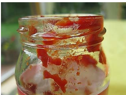
Fig. 6 IMM larva in a pupal cocoon found under jar lid.