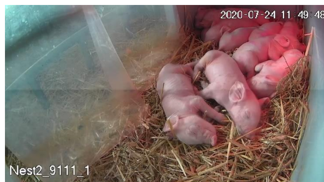
Piglets use the piglet nest as a safe resting area

The interviewed farmers made various suggestions for improvements in piglet nest design, ranging from automated climate control in the nest, improved visibility for animal control and optimization of the separation of the nest from the sow's lying area, to the short-term removal of bedding to improve the accessibility of the nest for newborn piglets. From the discussions, it was evident that despite predominant satisfaction with the piglet nest, there is definitely room for improvement and the farmers are actively interested in this.