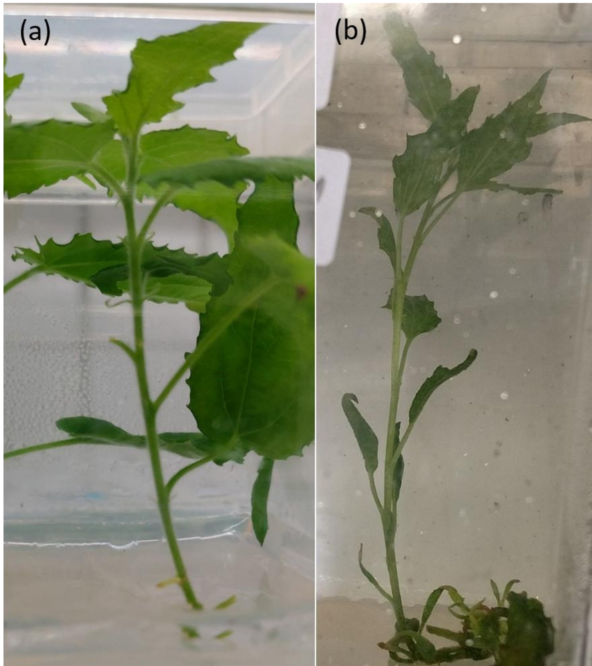
Figure 1. Representative poplar plants grown in vitro. (a) Not-transgenic control plant of P. × canescens clone INRA 717-1B4. (b) Plant with upright oriented leaves carrying a homozygous knock-out editing in both of the poplar Potri.014G102600 (“TAC-14”; orthologous to the rice TILLER ANGLE CONTROL 1 , ( TAC1 ) and its paralog Potri.002G175300 (“TAC-2”).

CRISPR/Cas9-mediated homozygous mutations in both P. trichocarpa paralogous genes Potri.014G102600 and Potri.002G175300 were transferred to soil and cultivated in the glasshouse for morphological inspections. In addition, lines N499-4-1, -11-1, -14-2, and -17-1 with a homozygous knock-out mutation in just Potri.014G102600 but a heterozygous one in Potri.002G175300 and line N499-13-2 with heterozygous mutations in both genes were also transferred to the glasshouse. Finally, the wildtype P1 and two regenerated but not-transgenic lines (without TAC1 -mutation; N499-6-1, and -9-1) were included as controls in the experimental tests in the glasshouse (lines transferred to the glasshouse are grey-shaded in the first column of Table 2).