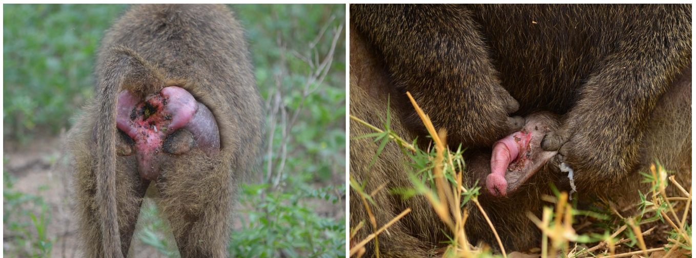
Fig 1. Genital skin ulcerations caused by Treponema pallidum subsp. pertenue . Olive baboon adult female (left) and adult male (right) at Lake Manyara National Park, Tanzania.

In Lake Manyara National Park (LMNP), Tanzania, olive baboons ( Papio anubis ) are infected with the bacterium Treponema pallidum subsp. pertenue as serological and genetic analyses indicated [19–22]. This bacterium also causes human yaws. In baboons, this infection is associated with moderate to severe skin ulcers of the anogenital area and external genitalia in both males and females (Fig 1). As observed in humans infected with T. pallidum , we