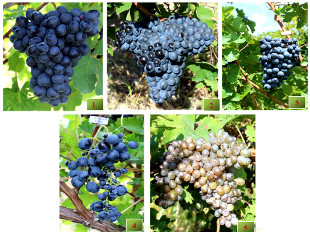
Figure 3. Bunch and berry morphology of Areni “family”: (1) Sev Areni. (2) Lyustra. (3) Movuz. (4) Seyrak Areni. (5) Mormor.

As shown in Figure 3, obvious differences are related to bunch shape and density. Seyrak Areni has small, very loose, mainly conical or cylindrical-conical, sometimes winged bunches. In contrast, Lyustra shows dense or very dense, conical and winged bunches. Wings surround the bunch from all sides and due to this shape of the bunch, local farmers call it Lyustra, which means chandelier. Movuz was collected from different villages and vineyards. All samples displayed the same genetic profile matching Sev Areni.