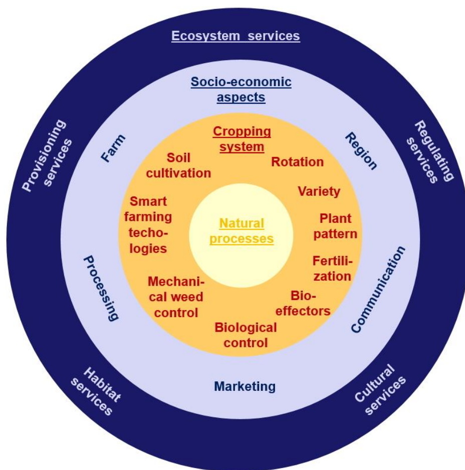
Figure 3. Schematic representation of essential levels and aspects to be considered in the development, implementation, and evaluation of mineral-ecological cropping systems.

The design, implementation, and evaluation of MECs need to take into account various aspects at different levels (Figure 3). Multi-year system field trials are needed to capture crop rotation and long-term effects of cropping systems. Only a holistic approach will allow an adequate comparison of MECs with conventional and organic cropping systems. This includes studies at the farm, regional, processor, and consumer levels with respect to success criteria and possible adaptations. Finally, MECs and their contribution to improved ecosystem services in comparison to conventional cropping systems needs to be evaluated. In the following, various key aspects of MECs (Figure 3) based on both scientific literature and the approach of the project “Agriculture 4.0 without Chemical-Synthetic Plant Protection” are outlined and discussed.