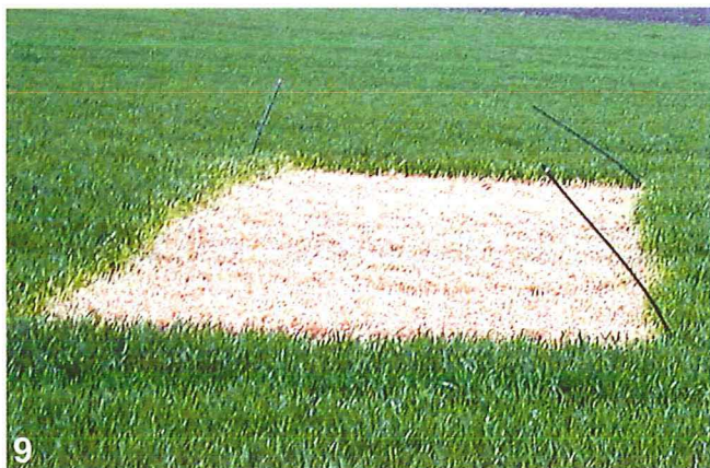
Fig. 9. Distinct separation of the sprayed area (ID 120 015, 3 bar, 250 l/ha).