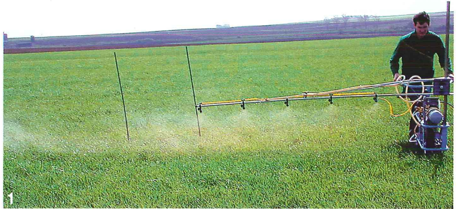
Fig. 1. Application with a Schachtner plot sprayer, wind speed 7 m/s. XR 110 02, 1.9 bar, 200 l/ha.

line VII – 2.1.1 (BBA, 1992). According to the guideline, petri dishes have to be used as artificial collectors for drift sediments, placed downwind on a field on bare ground. This drift scenario with bare ground away from the field is rather rare in practice. Drift sedimentation on plain bare ground is with respect to wind and air movement very different from drift deposition on a canopy which changes air speed and direction due to its roughness and structure.