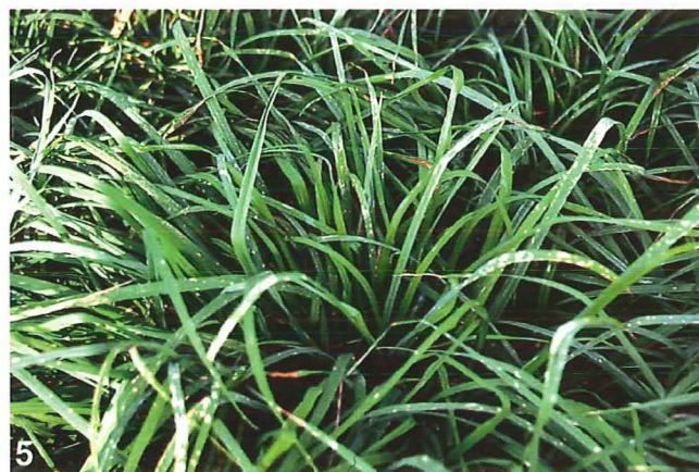
Fig. 5. Paraquat spots on leaves of a grass canopy. Trial carried out in a set aside meadow with a very inhomogeneous and rough canopy. Particles do not penetrate into the deeper zone of high leaf density.

In a separate trial Paraquat was applied under calm conditions, comparing the deposition pattern of applications with high and low fine drop volume. Figure 7 and figure 8 give an impression of the application situation in wheat. The spray and the drift cloud of the XR 110 02 are clearly visible. The acceptable hori-