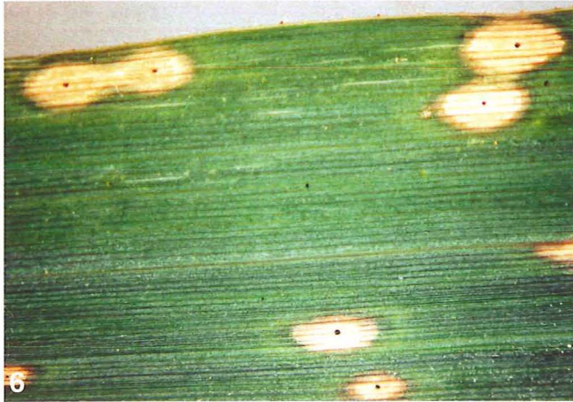
Fig. 6. Single Paraquat induced spots on Phragmites australis showing the blue coloured original particle size.

zontal distribution is proved by checking the boom on a patteringator and by full efficacy one week after application as shown in Fig. 9 and 10. Both pictures show the expected effect of Paraquat within the sprayed plot. Much more interesting are the borders and the transition zone from the sprayed to the unsprayed area. While the air induction nozzle creates a clear cut borderline to the unsprayed zone, there is a gradient of about 1 m at the edge of the XR 110 02 treated plot. This 1 m wide zone is produced by fine droplets, sedimenting uncontrolled in a random process (Fig. 10). "Uncontrolled" means that the droplets do not follow a directed flight path between nozzle and impact position but float in the air and sediment elsewhere, depending on meteorological conditions.