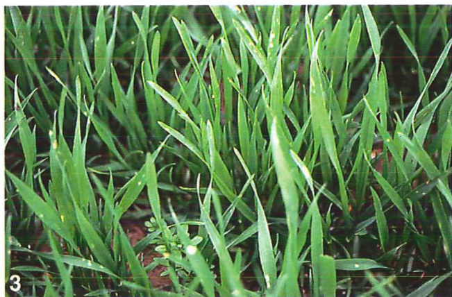
Fig. 3. Close up picture showing single spots induced by single particles less than 100 \mu\text{m} in diameter (wheat).