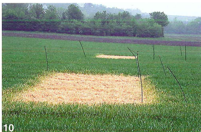
Fig. 10. Even at calm is a clear gradient established, indicating the transition from sprayed to unsprayed (XR 110 02, 1.9 bar, 300 l/ha). In the back the plot shown in Fig. 9.

contact. Beside the deposit ( \text{ng}/\text{cm}^2 ) the covered leaf surface is another predominant factor of affect assessment.