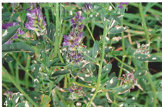
Fig. 4. Close up picture showing single Paraquat induced spots on alfalfa. Each dot is the result of a single droplet smaller than 100 \mu\text{m} in diameter.

the pattern of chlorophyll destruction induced by Paraquat, highlighting the typical drift gradient over distance. That gradient is documented, e.g., in the German basic drift values (GANZELMEIER et al., 1995). Such figures are understood to summarise the drift process as a whole in the drift area. Clearly visible in figure 2 are more or less affected areas resulting from trails of drift deposition. These drift trails document the variation of droplet deposition and give an impression of how fast wind velocity and wind direction are changing. The length of the marked plot is 10 m with a duration of the application of 10 s. The overall view in figure 2 illustrates a pattern which we term the macropatchiness. It explains the variation of deposits at defined measuring distances as required for trials done according to the BBA-Guideline (BBA, 1992). In other trials, samples were taken along the indicated measuring distances at 1 m, 3 m, 5 m and 10 m down wind of the sprayed plot in order to quantify drift deposits on plant surfaces (KOCH et al., 2003). The effect of wind can also be seen at the weather side of the plot where the Paraquat symptoms are shifted towards the centre of the plot (Fig. 2). This clearly shows that only fine droplets are transported by air movement. The majority of chemical is sedimenting out rapidly because of the mass and kinetic energy of each individual droplet, despite of air movement.