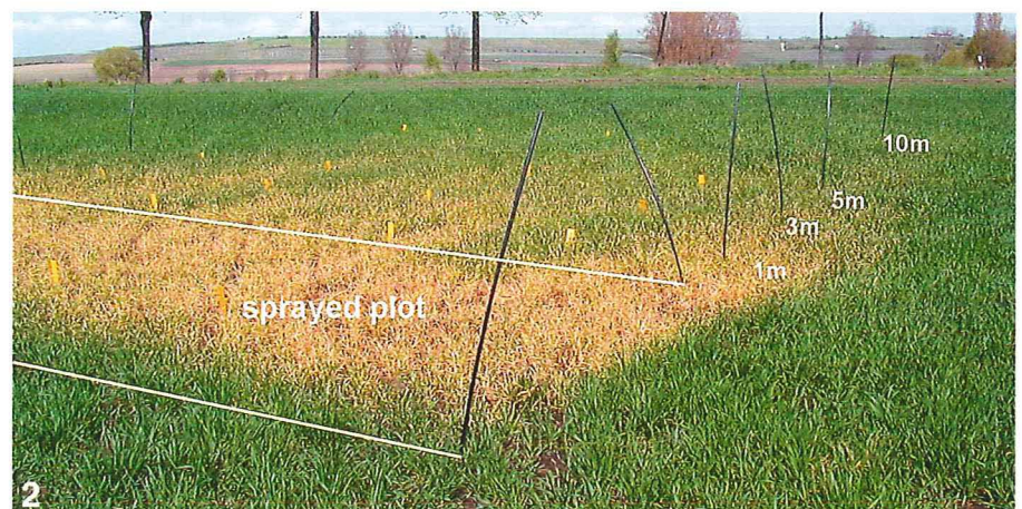
Fig. 2. Sprayed plot and drift pattern in wheat 2 weeks after application. Chlorosis is induced by Paraquat.

The results of this work are primarily visual, i.e., pictures of drift deposition patterns in cereal crops and meadows. Figure 2 shows