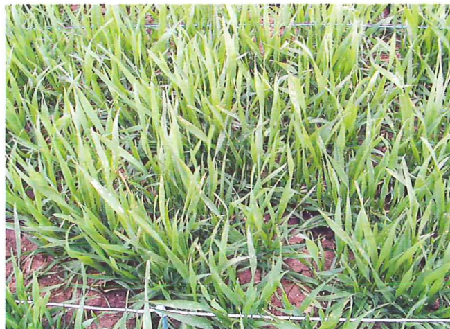
Fig. 3. Drift deposition pattern after Paraquat application, visualisation of the patchiness of drift deposits. Bleached spots are resulting from retained drifted droplets.

driving direction of the plot sprayer perpendicular to the actual wind direction. Within the drift zone, all levels of drift exposure are expected but cannot be allocated in advance. Nevertheless, 20 to 30 positions should be marked before application or at the moment of sampling (Fig. 1). The positions may be distributed throughout the drift zone at random. They should cover both the maximum expected deposit close to the sprayed plot and areas of very low exposure, by using positions far enough away from the sprayed plot. As a matter of experience from former described investigations 10 meters are said to be sufficient for accurate drift dose assessment. To relate deposit (dose) and effect, a tracer is added to the spray liquid. KOCH et al. (2003) used sodium-fluorescein (50 g/ha) for the investigation of deposits on plant surfaces because of its high sensitivity. The tracer is soluble in water and allows to quantify the deposits at the marked positions in the drift zone. The tracer deposit is measured using UV fluorescence spectrophotometry, expressed as ng/cm 2 leaf surface. Quantity and characteristic of the tracer must ensure adequate quantification within a wide interval of drift deposits and a low limit of detection.