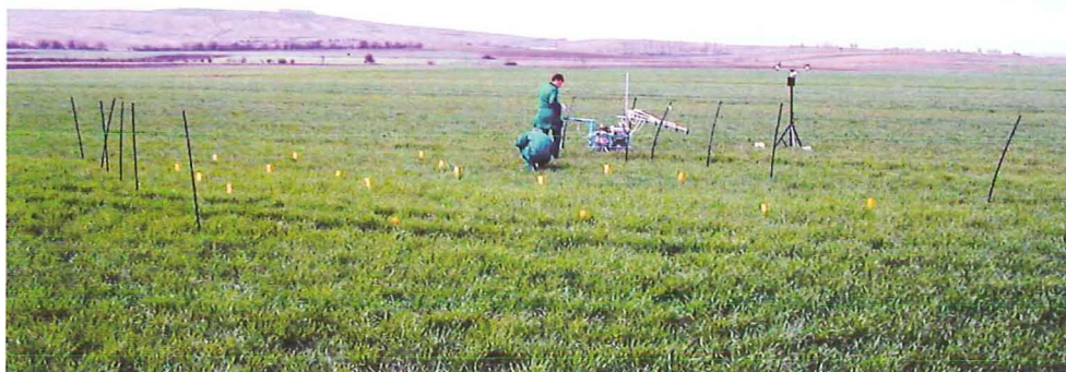
Fig. 1. Plot and drift zone with marked sampling positions (yellow sticks in the drift zone).

On the other hand, biological effects (efficacy or toxicity) depend on the quantity of chemical on the target itself, e.g. ng/cm 2 leaf surface, and also on the contaminated surface area or interface area. The amount of product retained on a target (e.g. leaf, fruit, etc.) is termed as deposit , and is usually calculated as the mean of individual values (KOCH, 1993). KOCH and WEISSER (1995, 2001) have emphasised the target specific relationship between nominal dose rate and deposits on targets within this area. Overlapping random processes within the application process itself result in a wide variation of individual deposits for a single application. A clear target specific relationship between nominal dose rate and mean deposit is observed from a series of deposit measurements (KOCH and WEISSER, 1995).