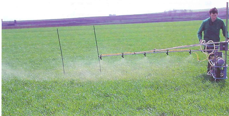
Fig. 2. Application with a plot sprayer under drift provoking conditions to assure an extended drift gradient (wind velocity = 7 m/s; nozzle: XR 110 02, 2.1 bar, fine drop volume ~10 %, 200 l/ha).

Using a plot sprayer and nozzles with high drift potential allow a crop/canopy to be treated with respect to the aim of study, i.e. plants, plant age, etc. can be chosen as required. Before performing the application, it is necessary to align the