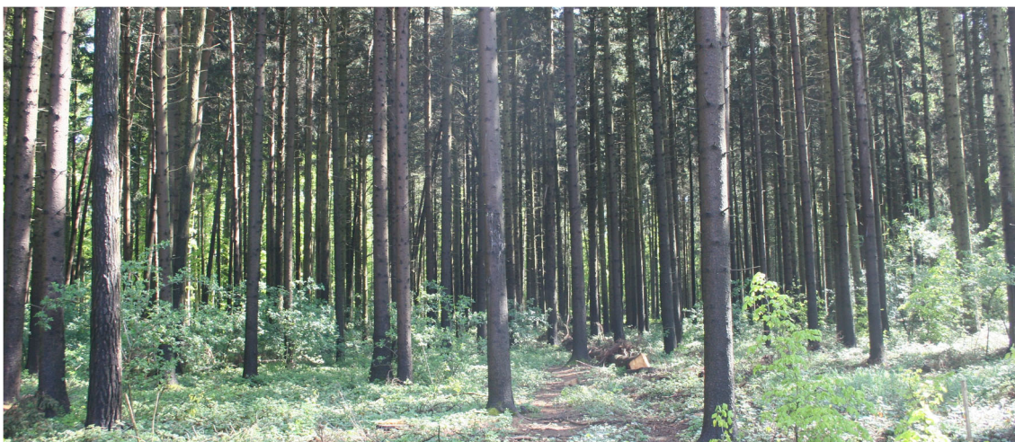
Fig. 6 Secondary spruce forest in Lower Austria. The spruce-dominated stand is approximately 80 years old. In the understory layer, deciduous tree species are regenerating.

conditions may keep the window for spruce management open under future climate conditions. In addition, Silver fir is seen as option at sites that are unsuitable for Norway spruce (Kapeller et al. 2012; George et al. 2015).