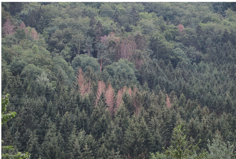
Fig. 7 Bark beetle infestation in Waldviertel/Lower Austria in 2018. After a mild winter and long dry spells during the growing season, heavy bark beetle infestations were recorded. Picture G Steyrer

Besides the immediate need to combat the spread of pests and pathogens, the strategies of adaptive forest management are numerous. It is possible to amend the forests with additional species, and thinnings can improve the water availability for individual trees. Even the rotation period can often be reduced because longer growing seasons allow reaching target dimensions of the timber market earlier. However, with