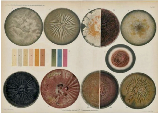
Fig. 3: Several Fusarium species after four weeks of different culture media (image taken from APPEL and WOLLENWEBER, 1910). 1. Fusarium solani , 2. F. orthoceras , 3a. F. subulatum on Agar No. 42 with orange colored conidia on pale aerial mycelium, 3b. F. subulatum on Agar No. 46 with dark red thallus depicted from below, 4. F. willkommii , 5. F. subulatum , juvenile stage of the culture from 3b, 6. F. coeruleum , 7. F. discolor , 8a. F. metachroum on Agar No. 42 with orange colored conidia, 8b. F. metachroum on Agar No. 46 with dark red submerged thallus, 9. F. finely powdered, darker colored conidia on ochre colored, wrinkled thallus.