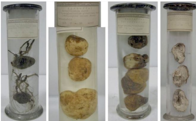
Fig. 4: Specimen of infected potato tubers preserved in formalin (collected and prepared by Otto Appel) – Left to right: Dying radicles caused by Rhizoctonia solani , Silver scurf caused by Spondylocladium atrovirens (= Helminthosporium solani ), two examples of Fusarium infested tubers (Phytopathological Collection of the Julius Kühn Institute).