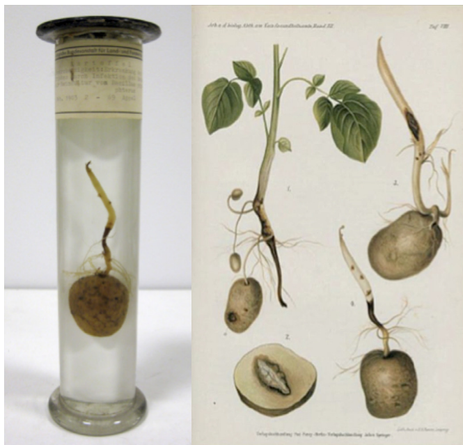
Fig. 1: Blackleg disease on potato. Left: sprouting potato with symptoms of blackleg disease after cultivation in infected soil, specimen collected by Otto Appel and preserved in formalin (Phytopathological Collection of the Julius Kühn Institute). Right: illustration in the pocket atlas of potato diseases, drawn by August Dressel (APPEL, 1926).