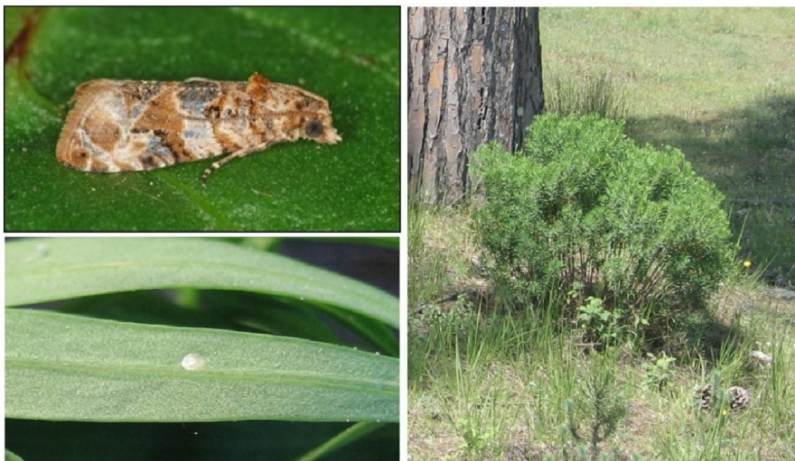
Fig. 1: Left, Lobesia botrana female (above) and its egg (beneath) laid on a leaf of Daphne gnidium . Right. A shrub of D. gnidium in the Migliarino-San Rossore-Massaciucoli Nature Reserve.

To date, twelve species of Trichogramma have been reported as natural egg parasitoids of EGVM (NOYES 2003). The Universal Chalcidoidea Database lists eleven species of Trichogramma Westwood, 1833 and one species of Trichogrammatoidea Girault, 1911, tested on L. botrana eggs in laboratory trials. Another species of Trichogramma was found on EGVM eggs in Iran (EBRAHIMI and AKBARZADEH-SHOUKAT 2008, LOTFALIZADEH et al. 2012).