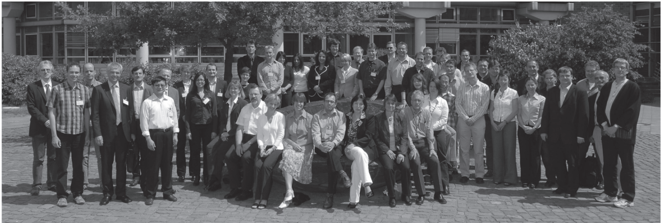
Workshop participants in front of the main building