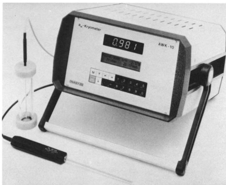
Fig. 1. NAGY a_w -Kryometer type AWK-10 with sample container and sensor.

Several related concepts for quality assurance of foods are currently under investigation within several FLAIR projects of the European Community: hurdle technology (used for food design), the HACCP