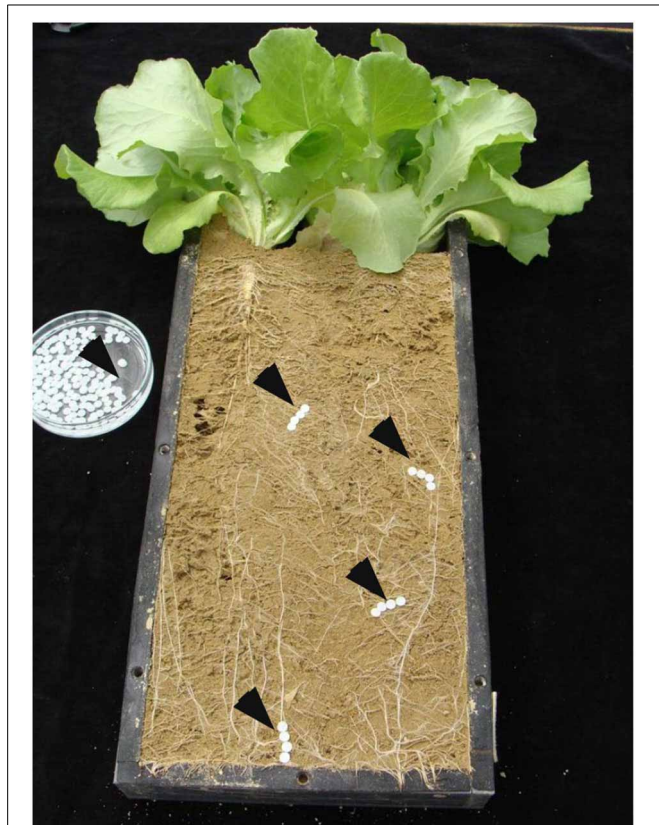
FIGURE 1 | Lettuce plants Lactuca sativa L. cv. Tizian (BBCH 19) grown on loess loam. Root observation window of a minirhizotron (rhizobox) prepared for exudate collection with sorption filters (indicated by black arrows).

For determination of the plant-nutritional status, 500 mg of dried leaf material was ashed in a muffle furnace at 500°C for 5 h. After cooling, the samples were extracted twice with 2 mL of 3.4 M HNO 3 until dryness to precipitate SiO 2 . The ash was dissolved in 2 mL of 4 M HCl, subsequently diluted ten times with hot deionized water, and boiled for 2 min. After addition of 0.1 mL Cs/La buffer to 4.9 mL ash solution, Fe, Mn, and Zn concentrations