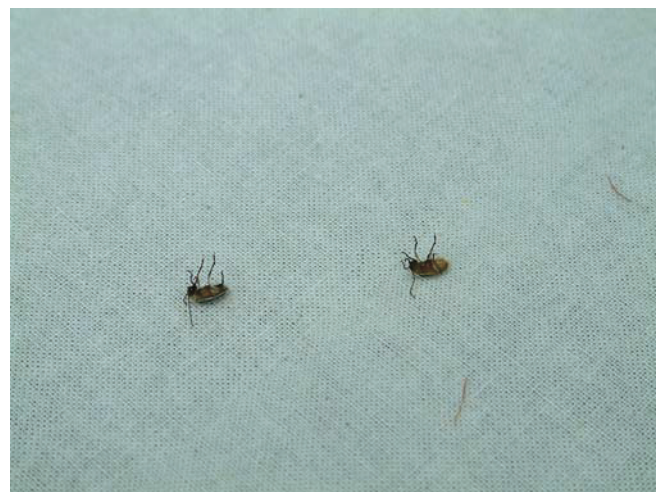
Fig. 3. Dead beetles of Diabrotica virgifera virgifera on cotton panels after insecticide application (72 g Thiacloprid/ha)..