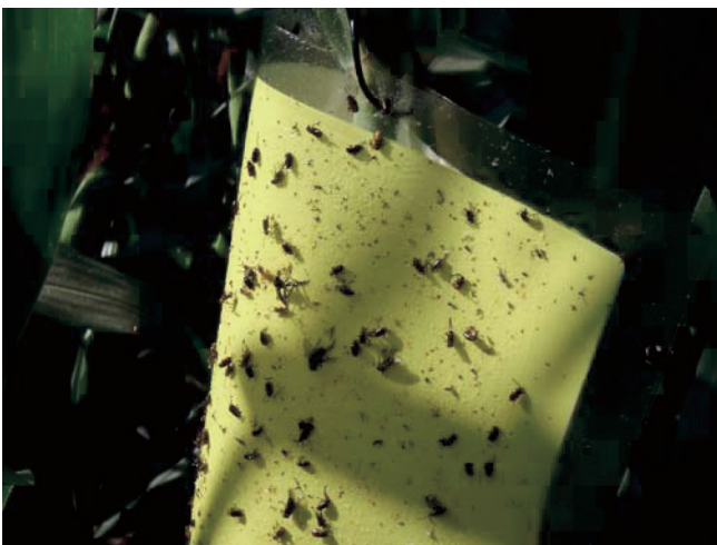
Fig. 1. Yellow sticky trap to estimate the population density of Diabrotica virgifera virgifera.