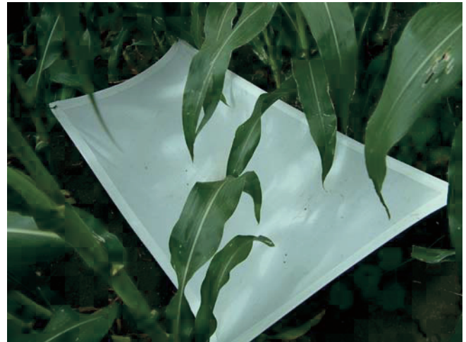
Fig. 2. Cotton panels mounted between maize plants to collect dead Diabrotica virgifera virgifera after an insecticide application.

Data collected with both methods were analysed graphically with box plots and numbers of beetles in treated and control plots were compared at each collection date with Mann-Whitney-U tests, using SPSS.