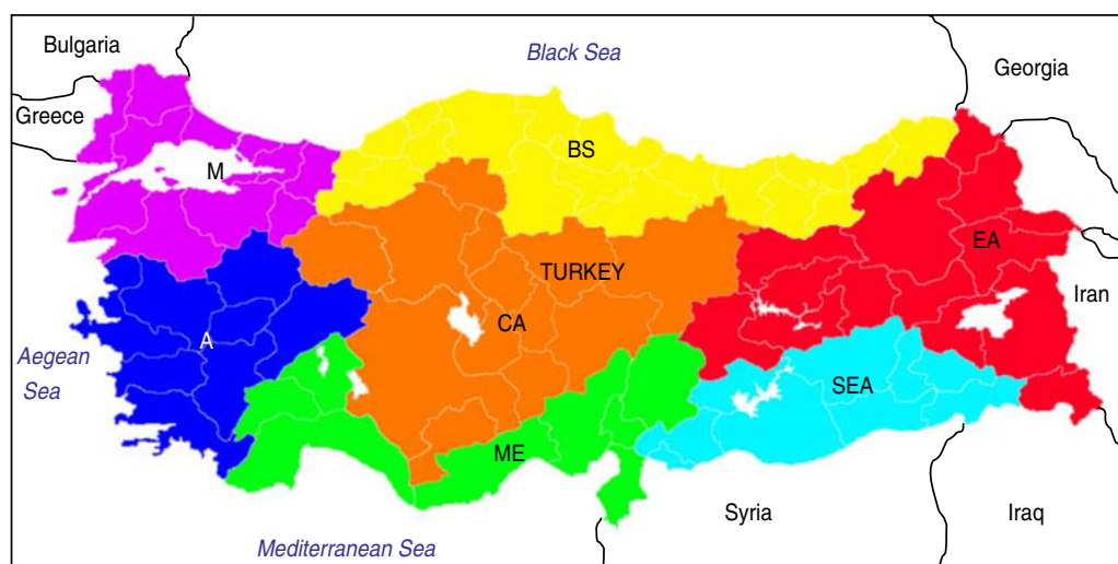
Fig. 1 [colour online]. Map of Turkey showing the different geographical regions in the study. A, Aegean region; BS, Black Sea region; CA, Central Anatolia region; EA, East Anatolia region; M, Marmara region; ME, Mediterranean region; SEA, Southeast Anatolia region. Neighbouring countries and major seas are indicated.

Generalized linear models (GLMs) were used to investigate relationships between reported incidence of bovine rabies and wildlife or dog-mediated rabies. The influence of other extrinsic factors such as region, year and surveillance effort were also investigated using GLMs. Different model error structures (Poisson and negative binomial) were compared using Akaike's Information Criterion (AIC), and the best-fitting models were chosen using the likelihood ratio test. These analyses were performed using the R statistical programming language [13].